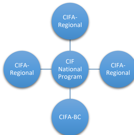
Figure 1. Hub and Spoke Model

The Royal Canadian Mounted Police (RCMP) in British Columbia (“E” Division) and National Headquarters (NHQ) led CIFA’s development in consultation with the Department of Finance Canada, the Federal Department of Public Safety and Emergency Preparedness Canada, and the Financial Transactions and Reports Analysis Centre of Canada (FINTRAC). CIFA-BC is connected to the federal anti-money laundering (AML) regime and initiatives therein via the Counter Illicit Finance (CIF) initiative. Provincial alignment is maintained through direct partnership with provincial ministries, including the AML Secretariat. The capacity for dual provincial and federal responsiveness enables CIFA-BC to address threats or risks at a regional level while concurrently working to integrate nationally identified goals and priorities. CIFA-BC is built on a hub and spoke structure consisting of CIF national coordination (the hub) and regional bodies (the spokes) that are anticipated for future phased development across other regions in Canada.