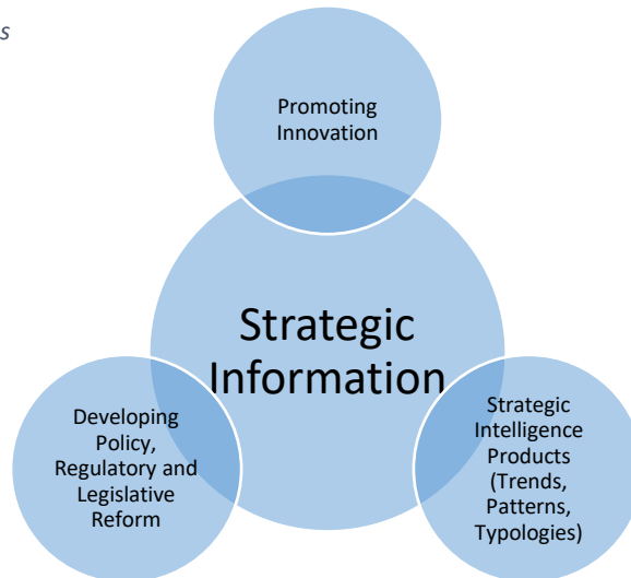
Figure 4. Activity Streams

These activities, which can be found in CIFA-BC's Logic Model (see Appendix 2 ), contribute to the outcomes of CIFA-BC, including the wide-scale prevention, detection, and disruption of money laundering across sectors and communities.